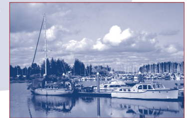
From the 92-foot extension of the workdock at the Boatworks to the new marina docks, improvements have been made at Swantown to provide boaters with a quality experience.