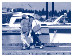
Swantown Marina offers both permanent and guest moorage on Olympia's East Bay.

We currently have openings for vessels up to 50 feet. However, there is a waiting list for the 52-foot and longer slips and for liveaboard status.