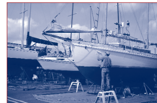
Complete repair services are available at the Boatworks, or you can do the work yourself in the fenced and lighted yard.

Swantown Boatworks has had the busiest season on record. By the end of the year, we expect to have hauled out over 700 vessels, an increase of 8.5 percent over 2003. Vessels ranged from 20 to 75 feet with