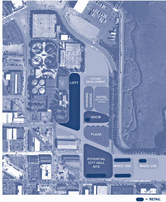
The preliminary draft site plan shows a new road layout and possible locations for development partners.

"The Port is enthusiastic about what the development of this property will mean to the community," said Van Schoorl. "Working with our partners, 2007 is shaping up to be an exciting year."