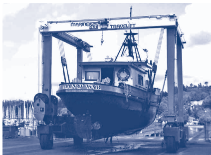
The Boatworks Travelift can haul out boats up to 22 ½ feet wide.

businesses and vendors that offer a variety of boat maintenance and repair services.