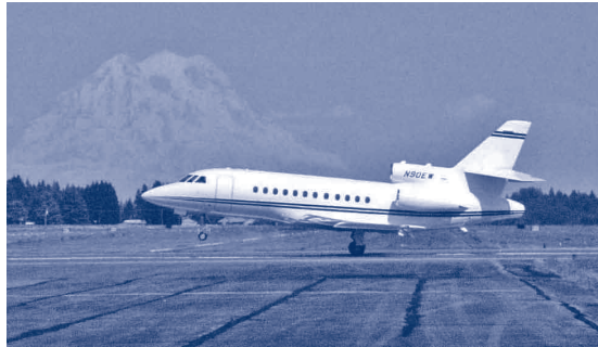
Extensive runway safety improvements at the Olympia Regional Airport are scheduled to be completed in 2007.

Projects scheduled for 2007 include: completing extensive runway safety improvements at the airport that have been underway for